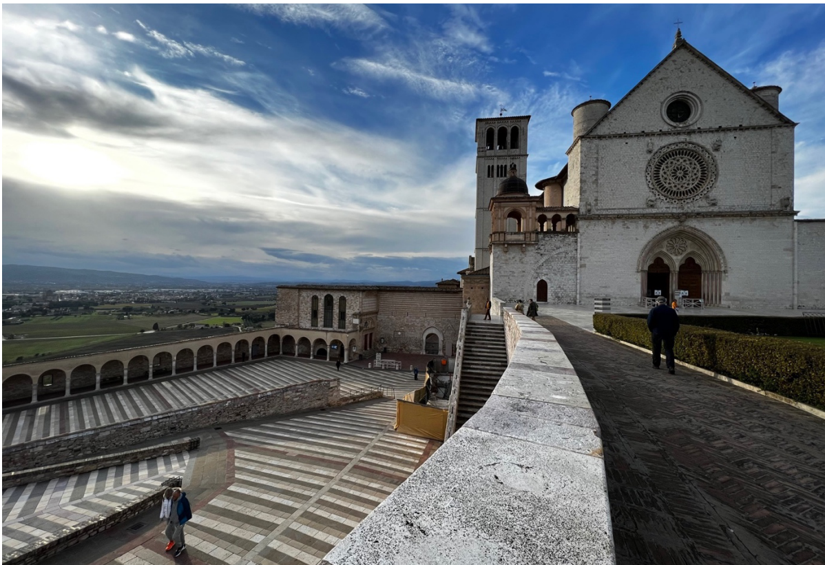
Basilica di San Francesco d'Assisi (Basilica of Saint Francis of Assisi)

Join us on this pilgrimage through Assisi, where Saint Francis and the origins of the Franciscan missions of Mesoamerica all began.