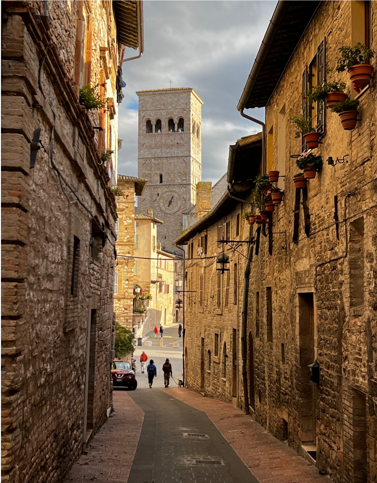
Via Santa Maria delle Rose overlooking Cattedrale di San Rufino di Assisi (Cathedral of San Rufino)